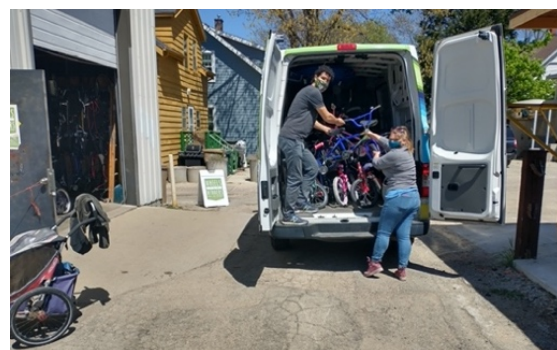
City of Madison staff loading our donation of 23 bikes for Bike Rodeo held at Allied Park.

Seeking to better support local efforts to bring life back to the community, we expanded our contributions to help biking events succeed. Our volunteer mechanics attended 26 community and other events held from April to October, where we repaired 402 bikes, five times our 2020 repairs. Highlights included three trips to Bayview Foundation to repair 49 bikes, 20 repairs at the June Ride the Drive at Marlborough Park, maintenance of One City School's bike fleet by completing 49 repairs, 19 repairs during a Bike Rodeo held by the Monona Police Department at Nuestro Mundo Community School, and tuning up 38 bikes used by Lussier Family Heritage Center for biking programs involving county parks such as Youth Environmental Leadership experience , Junior Naturalists , Summer Adventure Program , and Get Outside .