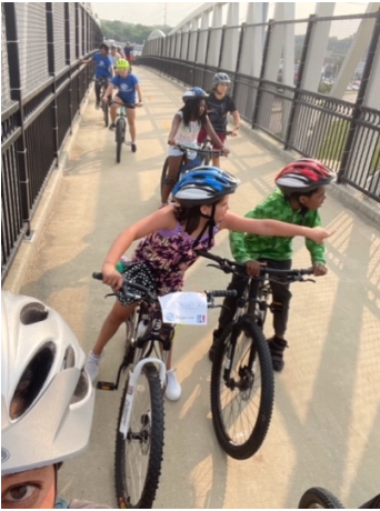
Wheels provided locks and loaner bikes for a mountain bike club operated by the Boys and Girls Club

Beside ramping up our repairs, we supplied much needed bikes to enable community organizers to meet the challenges of running successful events. Fifty-three bikes were provided to Centro Hispano for 2020 Three Kings Day and other giveaways, while its community partner Roots4Change received 10 bikes. When another kid's bike organization did not have enough bikes for their community wide initiative, we filled the need by providing 45 bikes to kids and their families at Eagle Heights with the request for them to "pay it forward" by doing good things for the community. On top of performing 31 bike repairs at a Madison-sponsored Bike Rodeo, we supplied 23 bikes for the Allied Park event that distributed 72 bikes among 350 participants. We also donated 14 bikes to start up Bike Federation's Madison-based bike fleet.