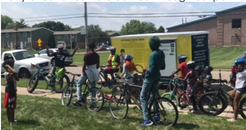
Kids getting loaner bikes from BikEquity's Kitty Knox Mobile Bike Library

Forty of our bikes were earned through our partnership with BikEquity, a new non-profit that