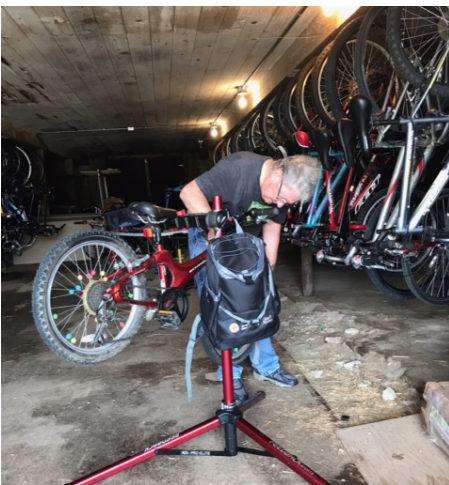
A repair at one of 39 offsite events

Looking back on this year, Wheels again rose to the occasion and accomplished much that we can be proud of. We can be thankful for many things including a generous outpouring of bike donations and financial support, the redoubled efforts of our dedicated volunteers, and new-found opportunities and partnerships. We distributed 345 bikes within our community thanks to our volunteers who refurbished bikes at a record pace-- additionally repairing another 400+ bikes at 26 community events. Responding to increased needs within our community and partners who faced challenges getting bike earners to the shop, we pursued creative ways to distribute bikes and be of service. Our new partnerships with BikEquity and Waunakee Neighborhood Connection enabled us to better meet our goals of expanding access to biking for