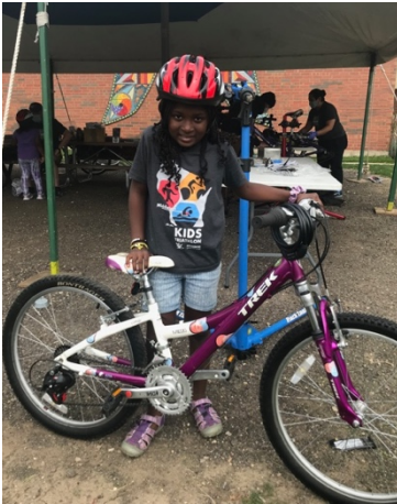
Bayview Foundation bike recipient