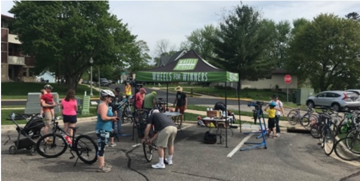
Repaired 35 bikes at Waunakee Bike Rodeo

With input from community members, we built additional flexibility into our earner model to recognize the challenges faced by our bike earners from communities of Color. With these changes, we saw creative forms of community service and increases in the number of bike recipients including older earners. For example, 20 earners got their bikes by organizing rides and promoting cycling. Nearly 75 percent (180) of our 250 earners identified as a member of a community of Color. Nearly 70 percent (167) were 18 or under.